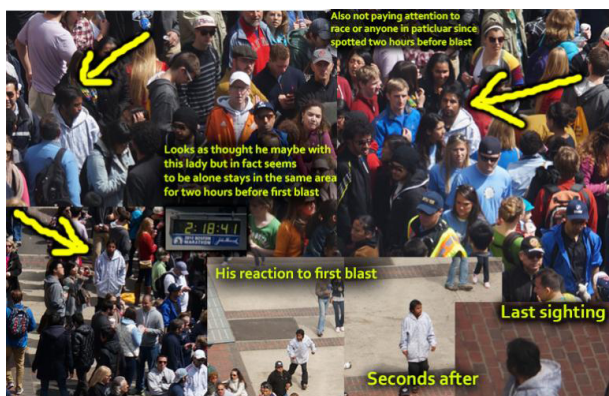
Figure 1. Photo posted on Reddit showing potential suspects in the Boston bombing

Recent incidents include accusing and casting suspicion on innocent people after the Boston marathon bombings. 4chan and reddit users created 'photo think tanks' and crawled through the photos that were released by the FBI. The FBI planned to crowdsource to be able to gather more photo and video material from the incident. This worked out well and thousands of photographs were submitted to the FBI. In a second step, the 'crowd' was asked to identify the suspects, but the crowd already started their own investigations: a whole subreddit called 'FindBostonBombers' was dedicated to finding the suspects (see Fig. 1).